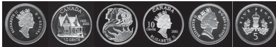
Canada and Great Britain NCLT