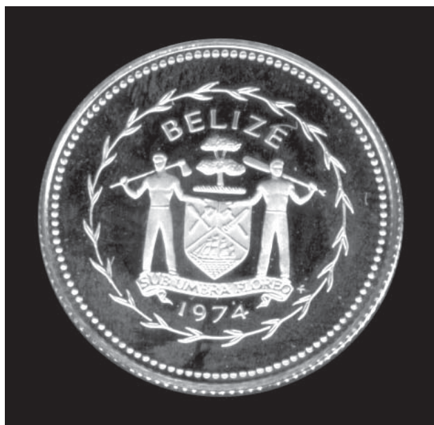
1974 - TEN CENTS - REVERSE

FOOTNOTE: The Franklin mint, Franklin Center, Pa., U.S.A. was the world's largest private mint, founded in 1965.