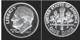
United States of America NCLT 2007 One Dime