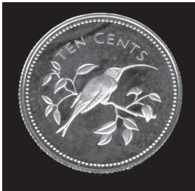
1974 - TEN CENTS - OBVERSE