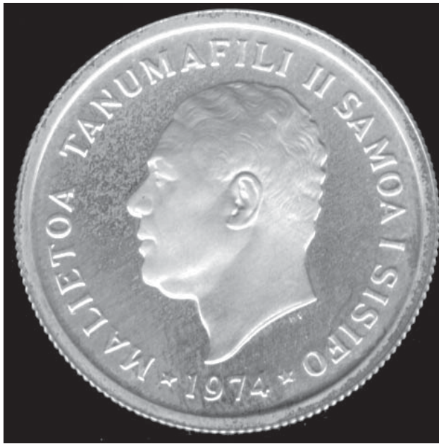
1974 - 5 SENE - OBVERSE