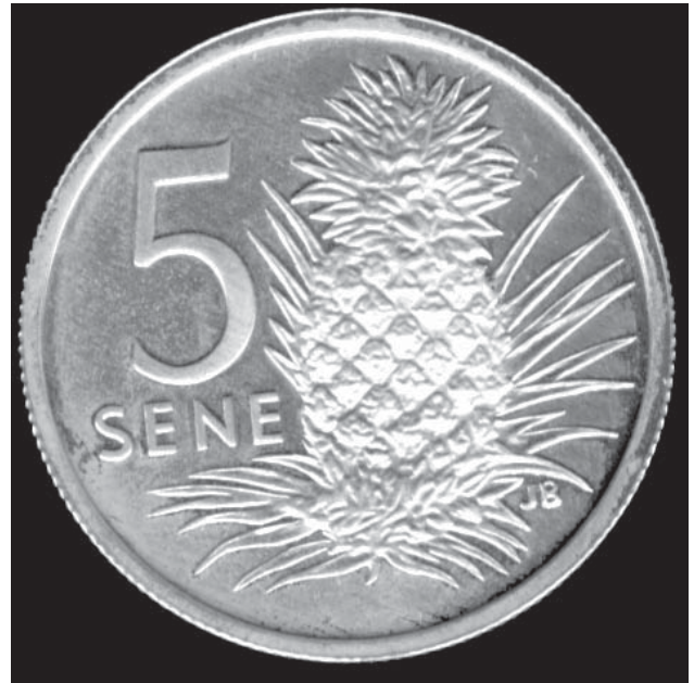
1974 - 5 SENE - REVERSE

FOOTNOTE: Since this work was first completed, both the United States and Canada have produced NCLT dime size silver proof coins. The United States has issued silver proof sets with the same design as their circulation non-silver proof sets and the regular annual coinage designs each year. Each set has contained a silver proof dime. More recently Canada has issued a series of silver 10 cent proof dime size silver commemorative coins. Both of these would be classified as NCLT coins. Macau issued proof sets 1982-85 with a dime size silver 10 Avos coin. Great Britain issued a NCLT 5 pence sterling coin in special set dated 1990.