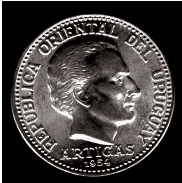
1954 - 20 CENTESIMOS - OBVERSE