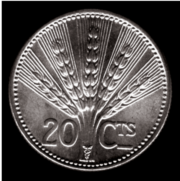
1954 - 20 CENTESIMOS - REVERSE

FOOTNOTE: Jose Gervasio Artigas, Protector of Uruguay, 1813 - 1820.