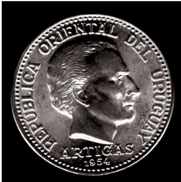
1954 - 20 CENTESIMOS - OBVERSE