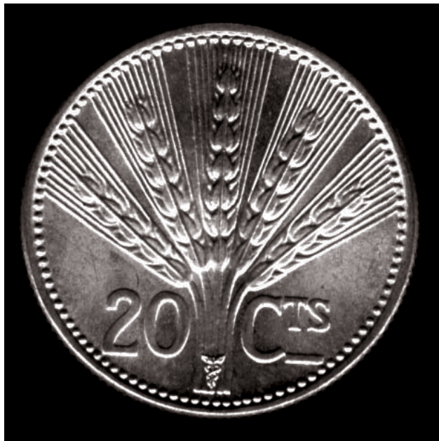
1954 - 20 CENTESIMOS - REVERSE

FOOTNOTE: Jose Gervasio Artigas, Protector of Uruguay, 1813 - 1820.