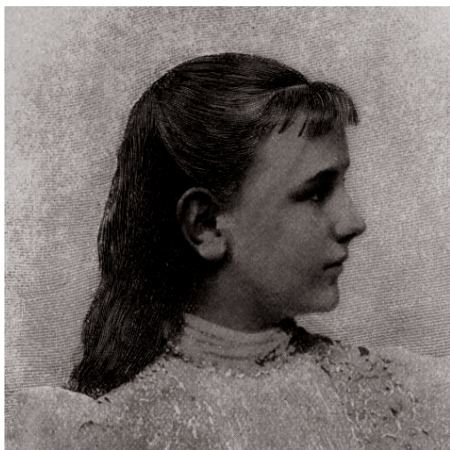
Young Queen Wilhelmina

FOOTNOTE: The United Netherlands from 1815 to 1830 created by the Congress of Vienna, in a move to provide a strong barrier against France, united the ancient Netherlands under a Dutch King of the House of Orange. The experiment failed, not only because of differences in race, language and religion, but also quite as much because the southern provinces were treated unfairly in such matters as office-holding and parliamentary representation. Against such discrimination the southern provinces protested in their revolt of 1830 and organized themselves as a separate state under the name of Belgium. The Dutch King, William I, offered what resistance he could, but had at last to give way. In 1848 the Constitution of 1814 was replaced by a more liberal one. The King has at his side a law-making body, called the States-General, composed of two houses. The upper house represents the Provinces and is chosen by Provincial Legislatures, while the lower house is elected by the people, practically (since 1896) on the basis of manhood suffrage. The large colonial possessions in Asiatic waters (Netherlands East Indies), a remnant of the more considerable territories acquired in the heroic days of the Republic, present many difficulties, at the turn of the century, but are still managed at a profit. New International Encyclopedia, 1910.