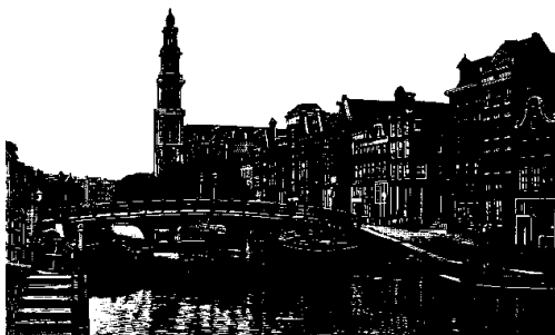
Canals of Amsterdam

FOOTNOTE: In 1814 the Provinces of both Holland and Belgium were united by the Treaty of Paris to form the Kingdom of the Netherlands. This arrangement lasted till 1830, when the southern provinces broke away and formed the Kingdom of Belgium. King Willem I attempted to reduce the revolted provinces by force; but the Great Powers intervened, and finally matters were adjusted between the two countries in 1839. The King abdicated in 1840, and was succeeded by his son Willem II (1840-49), he being again succeeded by his son Willem III, who was succeeded in 1890 by his daughter Wilhelmina. New Cabinet Cyclopaedia, Phila., 1896.