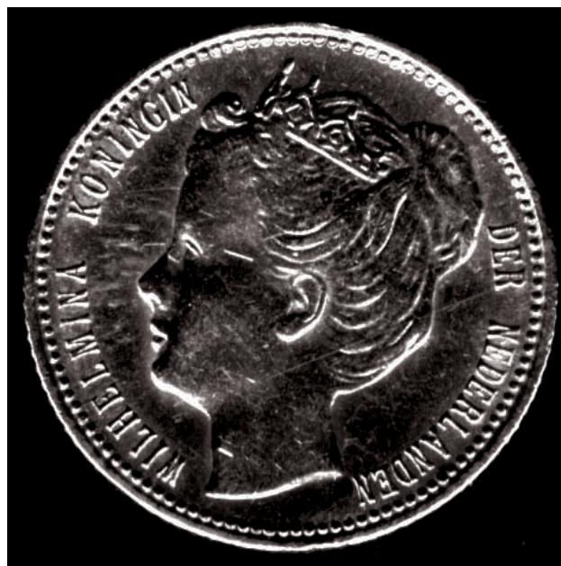
1906 - 25 CENTS - OBVERSE

FOOTNOTE: Queen Wilhelmina Helena Paulina Maria of Orange-Nassau was born August 31, 1880 at the Hague. The two sons of William III, William Paul Alexander Frederik Lodewijk, her father, by his first wife Sophia Frederika Mathilde of Wurttemberg, both died before 1890. Sophia died in 1877 and Willem Married again on January 7, 1879 to Adelheid Emma Wilhelmina Theresia, second daughter of Prince George Victor of Waldeck-Pyrmont. An only child Wilhelmina assumed the throne upon the death of her father on November 23, 1890, under her mother as Regent. On September 6, 1898 her 18th Birthday, she was crowned Queen in Amsterdam. On February 7, 1901 Queen Wilhelmina married Henry Wladimir Albert Ernst, Duke of Mecklenburg-Schwerin. Her only daughter Juliana was born on April 30, 1909 and succeeded to the throne on September 4, 1948 when Wilhelmina abdicated in her favor. She retired to the Palace at Het Loo, near Apeldoorn, Geldern. She died on November 28, 1962.