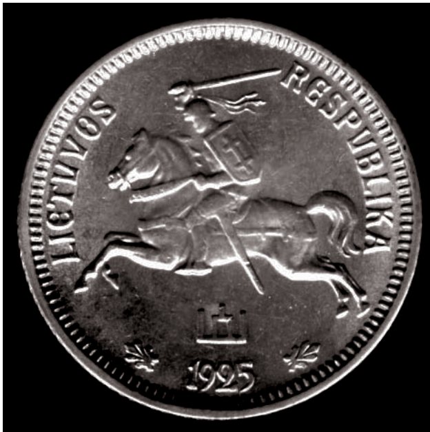
1925 - 1 LITAS - OBVERSE