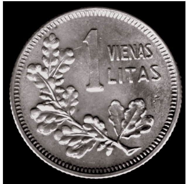
1925 - 1 LITAS - REVERSE

FOOTNOTE: The Republic of Lithuania on the Baltic Sea in northern Europe was formally a Grand Duchy and under the reign of Vytautas (AD 1392-1430) her frontiers extended from the Baltic to the Black Sea, all now part of Russia. Following the death of Vytautas, Lithuania gradually came under Polish influence and was united with Poland in 1569. At the end of the 18th century Poland fell under Russian rule along with Greater Lithuania. Lithuania minor was annexed by Prussia and following the First World War it was declared a Republic.