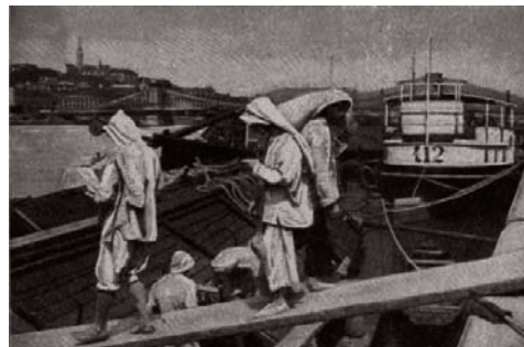
Unloading grain at Buda-Pesth