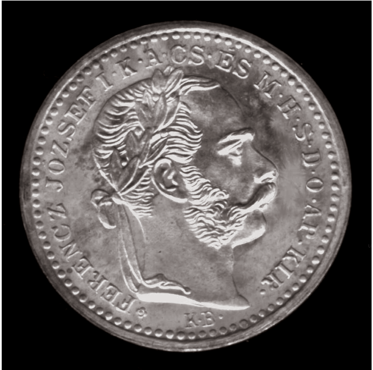
King Franz Joseph of HUNGARY proof restrike