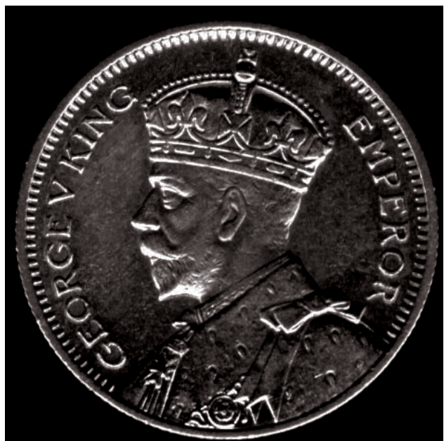
1936 - SIXPENCE - OBERSE

FIJI, BRITISH CROWN COLONY of LONDON MINT