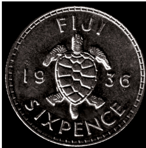
1936 - SIXPENCE - REVERSE

FOOTNOTE: Percy Metcalfe, born in Wakefield in 1895 sculptor and medallist. He was the designer for the 'Wembley Lion' for the British Empire Exhibition 1924-25, of the King George VI portrait of Fiji 6 Pence and the bust of King Farouk I as shown on Egyptian Y- 83. He died in 1969.