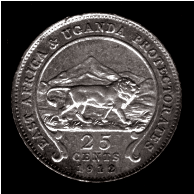
1912 - 25 CENTS - REVERSE