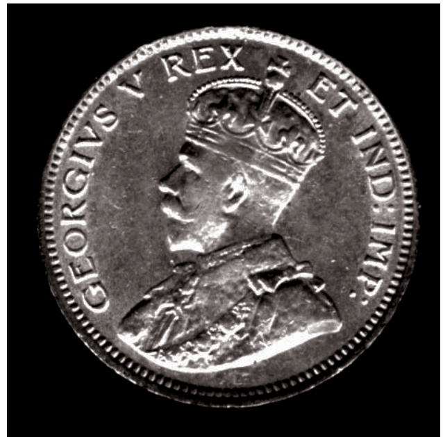
1912 - 25 CENTS - OBVERSE

EAST AFRICA & UGANDA, BRITISH PROTECTORATE of LONDON MINT