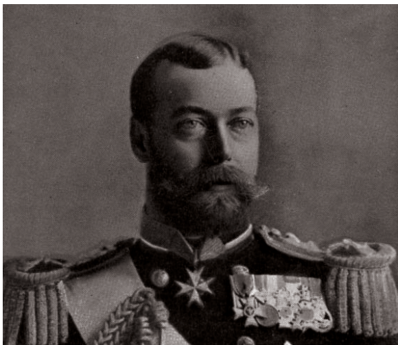
King & Emperor George V

FOOTNOTE: The inland Uganda Protectorate lying west of Kenya Colony, is the former Kingdom of Uganda. It was declared a British Protectorate in 1894.