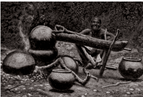
Native distillery, East Africa