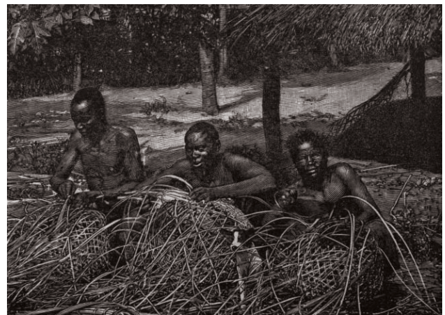
Native basket weaving

FOOTNOTE: The British Protectorate over the Territory of Uganda was proclaimed in the "London Gazette" on June 19, 1894, and included only the country subject to King Mwanga, known as Buganda. The population in census of 1911 was 2,843,325. In 1913 there were 823 Europeans, 3,110 Asiatics and 2,889,561 natives - total 2,893,494. The principle town of Buganda is Kampala, but the center of the Protectorate Administration is at Entebbe, 25 miles distant on the shores of Lake Victoria. The principle exports are ivory, skins, chillies (pepper), cotton, rubber, coffee, and sim sim. Whitaker's Almanack, London 1914.