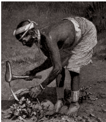
Woman planting, East Africa