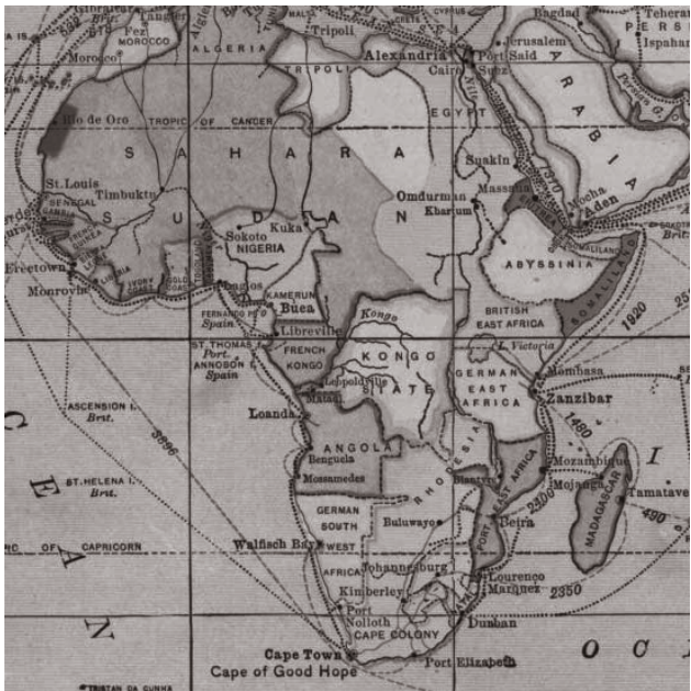
Africa showing British East Africa just below the equator

FOOTNOTE: The British Protectorate over the Territory of Uganda was proclaimed in the "London Gazette" on June 19, 1894, and included only the country subject to King Mwanga, known as Buganda. The population in census of 1911 was 2,843,325. In 1913 there were 823 Europeans, 3,110 Asiatics and 2,889,561 natives - total 2,893,494. The principle town of Buganda is Kampala, but the center of the Protectorate Administration is at Entebbe, 25 miles distant on the shores of Lake Victoria. The principle exports are ivory, skins, chillies (pepper), cotton, rubber, coffee, and sim sim. Whitaker's Almanack, London 1914.