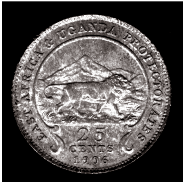
1906 - 25 CENTS - REVERSE