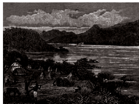
Village, East Africa - 1902