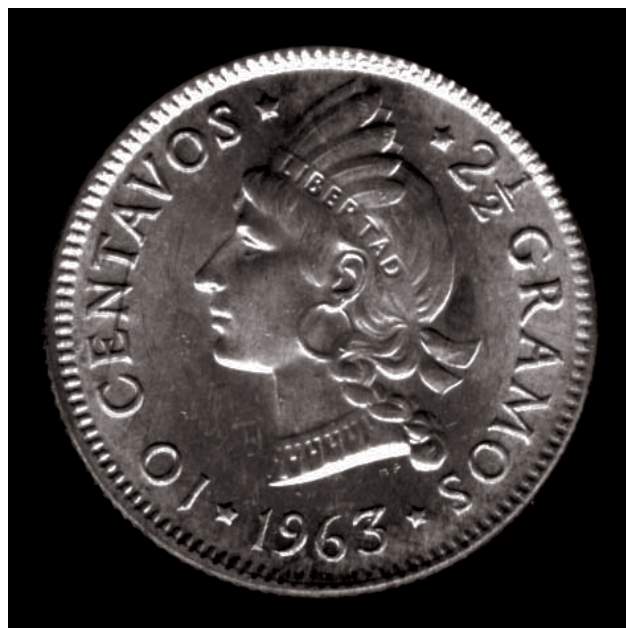
1963 - 10 CENTAVOS - OBVERSE

FOOTNOTE: Dominica, Spanish for "Sunday Island" indicative of its discovery by Columbus, namely Sunday, November 2, 1493.