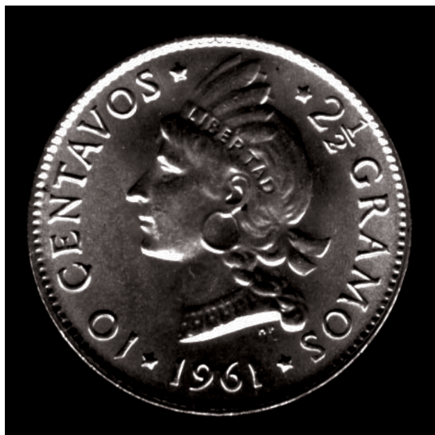
1961 - 10 CENTAVOS - OBVERSE