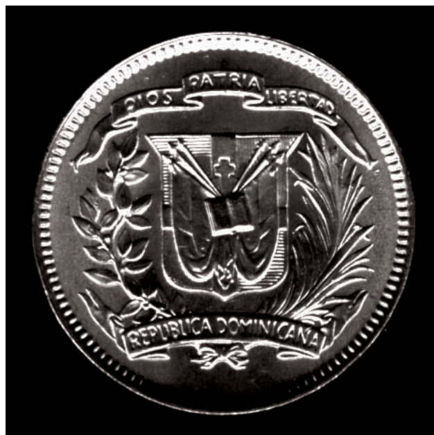
1961 - 10 CENTAVOS - REVERSE

FOOTNOTE: Victor D. Brenner, well known as the designer of the Lincoln cent and the 10 centavos of Dominican Republic. He was born Victoras Barnauskaus on June 12, 1871, in Shavli, Lithuania.