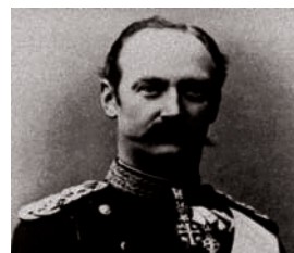
KING FREDERICK VIII