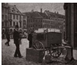
Milk cart, Copenhagen

FOOTNOTE: Copenhagen, meaning "merchant's harbor", is the capital of Denmark. It is the only harbor that can be entered by large vessels, standing at the entrance to the Baltic, it is a distribution point for Baltic trade with a great deal of freight forwarded on smaller vessels to Sweden, Russia and other Baltic ports. In 1894 to facilitate this growing trade a free port was established.