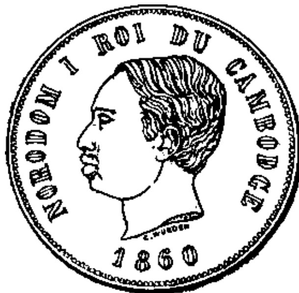
Nordom I King of Cambodia