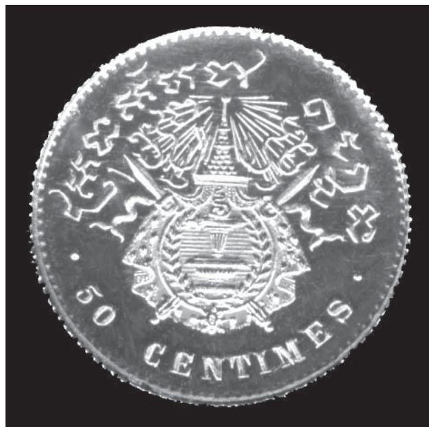
1860 - 50 CENTIMES - REVERSE

FOOTNOTE: Cambodia, an extensive country of the Indo-Chinese peninsula, now a Protectorate of France, bounded on the S.W. by the Gulf of Siam, on the S.E. by French Cochín-China, and on the N. by Siam. Area, about 33,000 sq. miles; population about 900,000. The surface is mostly flat, and the soil fertile. There are extensive forests, which shelter elephants and deer; there are also wild-cattle and ponies, and the rhinoceros abound. Among the chief products are rice, bertel, areca-nuts, gamboge, spices, sandalwood, and ivory. Iron occurs. Library of Universal Knowledge, N.Y. 1879.