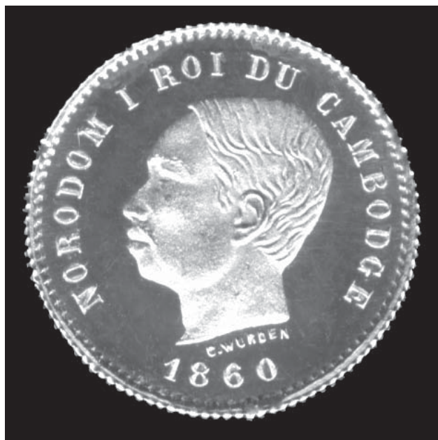
1860 - 50 CENTIMES - OBVERSE

CAMBODIA, FRENCH PROTECTORATE OF BRUSSELS