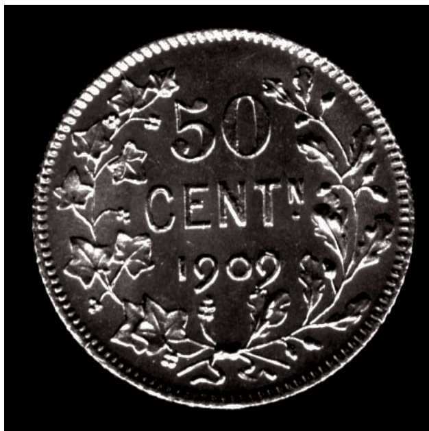
1909 - 50 CENTIMES - FLEMISH - REV

FOOTNOTE: There is a rare essai dated 1906 of this issue, CD-1602.