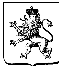
Arms of Belgium