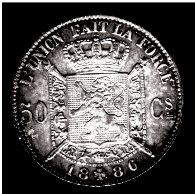
1886 - 50 CENTIMES - FRENCH - REV