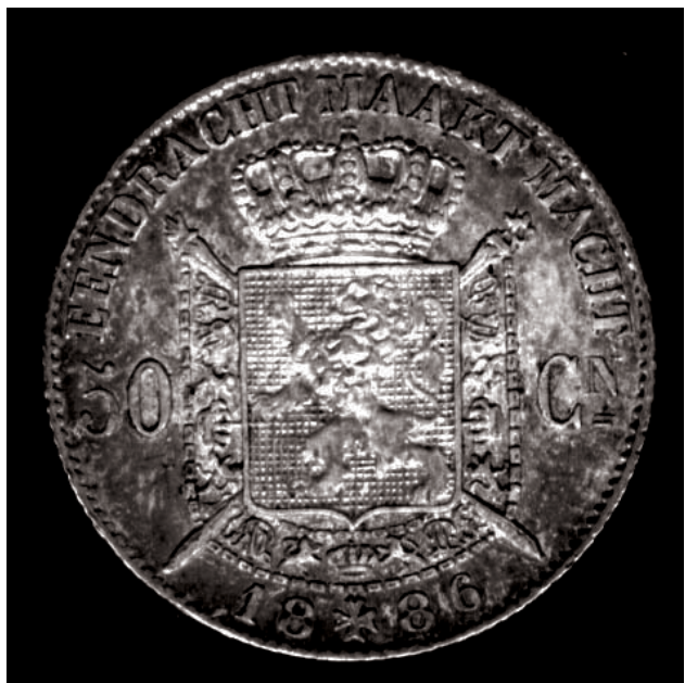
1886 - 50 CENTIMES - FLEMISH - REV

FOOTNOTE: Louis Philippe Marie Victor Leopold II, King of the Belgians was born April 9, 1835, the eldest son of King Leopold I. He married, in 1853, Marie Henriette, a daughter of the Archduke Joseph of Austria and ascended the throne on the death of his father, December 10, 1865. New International Encyclopedia, 1910.