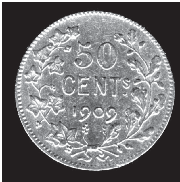
1909 - 50 CENTIMES - FRENCH - REV