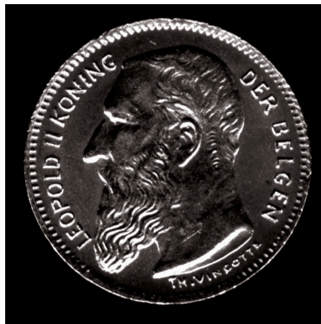
1909 - 50 CENTIMES - FLEMISH - OBV