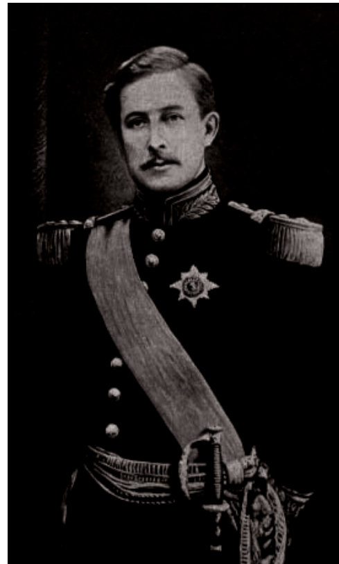
Albert I, King of the Belgians