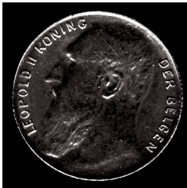
1901 - 50 CENTIMES - FLEMISH - OBV